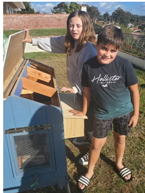
Our Personal Staff

Architect, Contractor and Builder of the Chicks' Custom Residence (Third Generation Egg Rancher)