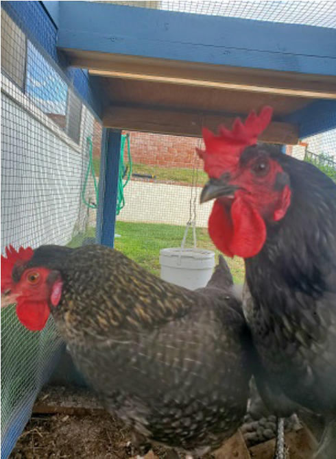
WELCOME TO OUR GUESTS!